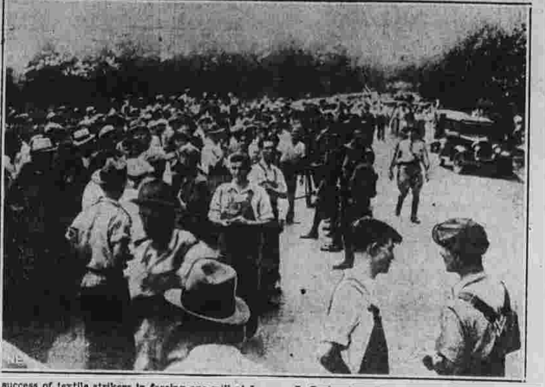
The success of textile strikers in forcing one mill at Lyman, S. C., to close down led to mobilization of the National Guard to prevent a recurrence of the situation at other plants nearby. The soldiers are shown above as they drove strikers back at bayonet points from mill property where they were seeking to induce workers to leave their machines.